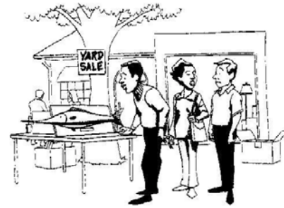
"How much would you take not to sell that to my husband?"

Please sign-up to help with the set-up, sale, bakery, or clean-up on the sheets posted. Thanks!